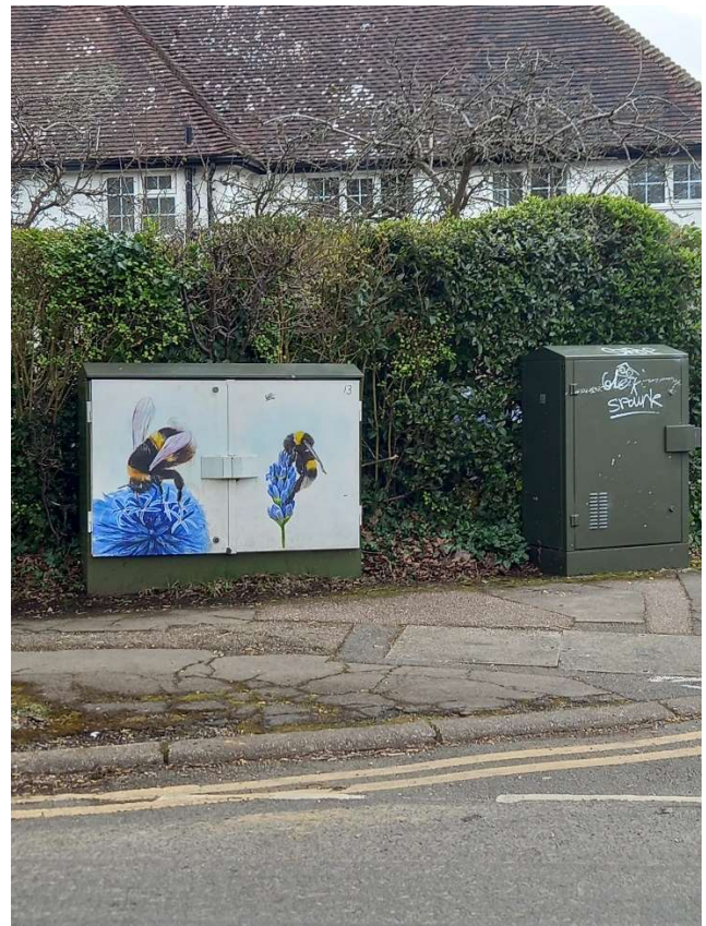
Side residential street – Westanley Ave

This initiative is brought to the attention of members of the committee to see if they wish to consider encouraging a similar activity within the boundaries of the Parish.