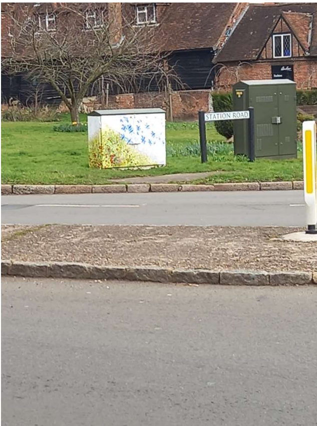
Main road – Station Road

Having visited the sites, the following pictures show the decorated boxes in-situ: