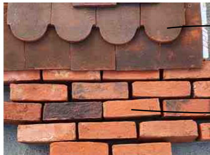
Proposed sample board of bricks, tile hanging and roof tiles at plot rear of 8 Somerset Way

Application for materials approval for no. 8 Somerset Way