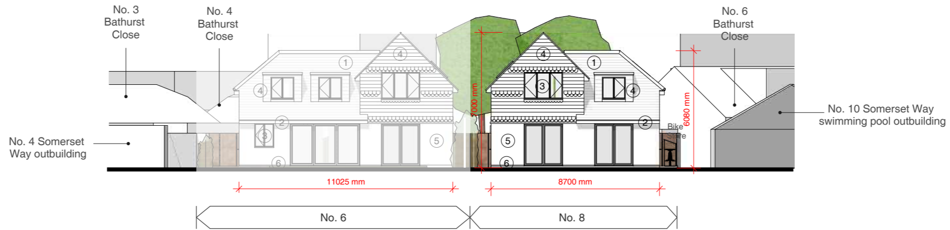
Proposed Rear Elevation - No. 6 + 8

Address: Land to the Rear of No. 8 Somerset Way, Iver, SL0 9AF Client: Mr James McMahon Date: September 2022